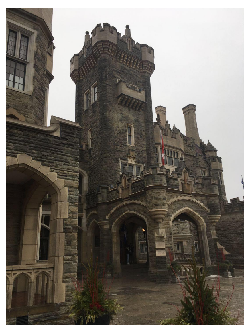
April Work Hard and play hard. It began with hectic study for the Finals and ended with excitement of post trip!